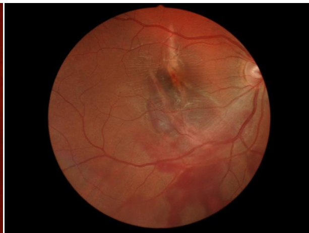
TRAUMA FROM BASEBALL