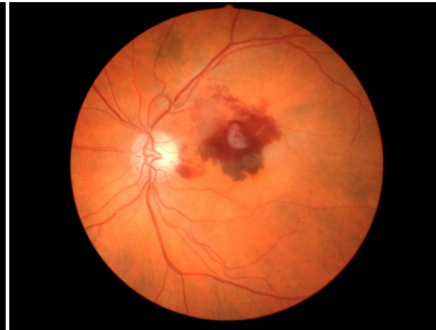
WET MACULAR DEGENERATION