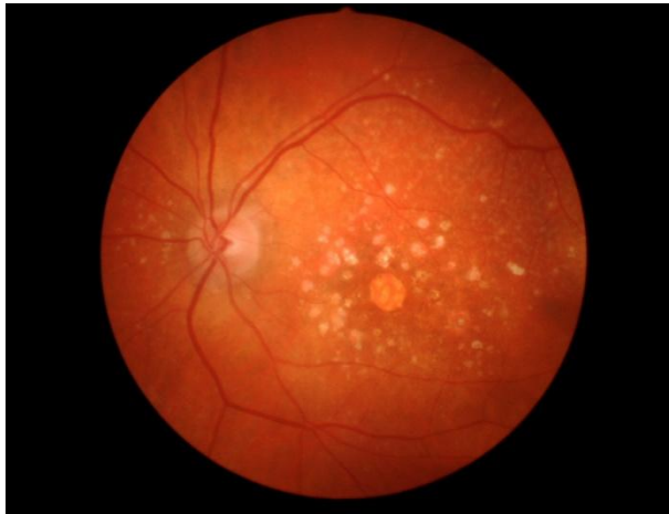
DRY MACULAR DEGENERATION